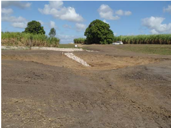
Newly constructed sediment basin.

To further filter sediments and reduce erosion, grass and macrophytes were established in the drains and the sediment basin's inlet and the outlet into the wetland.