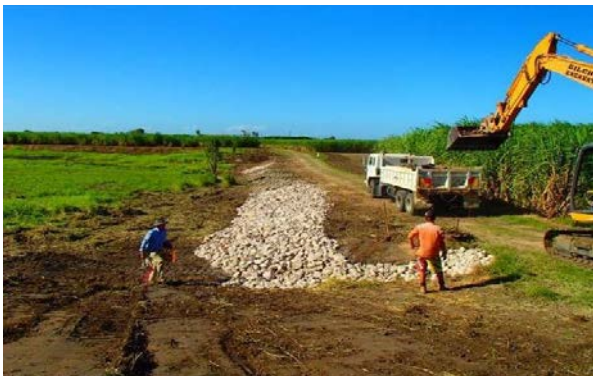
Works on the access road and diversion bank.