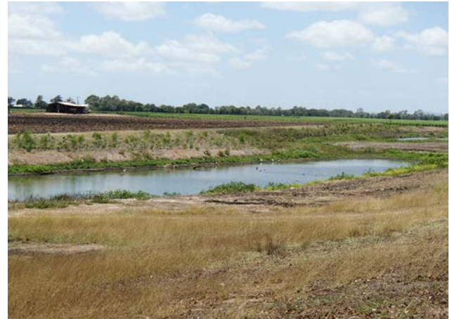
The wetland six months after construction.