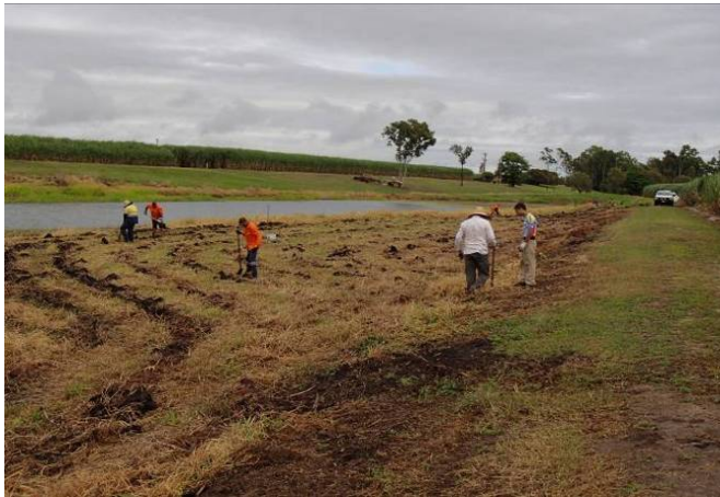
Tree planting at the wetland.