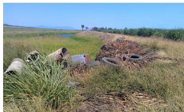
The wetland prior to the project commencing.