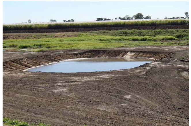
Sediment basin with irrigation water.