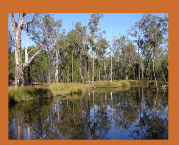
Speculation Creek (Barakula State Forest).

A number of Queensland's wetlands are nationally and internationally acknowledged for their significant values — five wetlands are listed under the international Ramsar Convention and 210 are nationally recognised in A Directory of Important Wetlands in Australia (June 2005) www.deh.gov.au/ water/wetlands/database/index.html. Of the 32 natural wetland categories defined in this directory, 29 occur in Queensland. Wetlands are also recognised as being of regional significance through the natural resource management (NRM) planning process being undertaken across Queensland www.nrm.gov.au/ index.html.