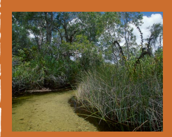
Bowarrady Creek (Fraser Island).

In addition to legislation, policies and strategies to protect wetlands have been developed at both the national and State level. These have been developed in accordance with the internationally recognised Ramsar Convention, which aims to halt the worldwide loss of wetlands and to conserve those that remain through wise use and management. Like the Ramsar Convention, Australian and Queensland policies recognise the environmental, social and economic value of wetlands and promote the conservation, enhancement and ecologically sustainable use of wetlands. These policies can be found on the Australian Government Department of the Environment and Heritage www.deh.gov.au/water/ wetlands/publications/policy.html#HDRnl5 and Queensland EPA www.epa.gld.gov.au/ publications?id=565 websites.