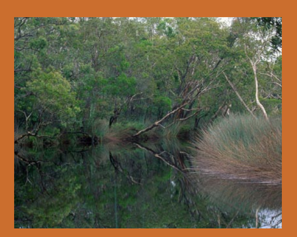
Lake Cooloola (Great Sandy National Park).