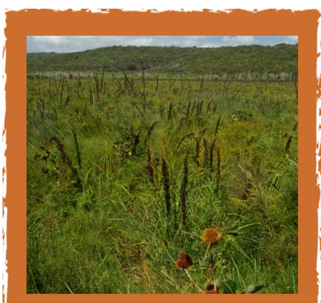
Coastal wet heath – sedgeland community with swamp banksia Banksia robur in the foreground and sword grass Gahnia sieberiana mid-photo.

WETLANDS are broadly defined as areas of permanent or periodic/intermittent inundation, with water that is static or flowing, fresh, brackish or salt, including areas of marine water the depth of which at low tide does not exceed six metres.