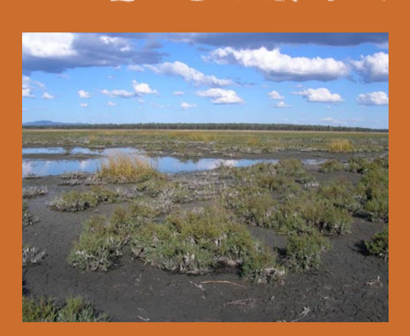
Samphire saltmarsh vegetation used for foraging by the bird species, yellow chat Epthianura crocea macgregori (Dawson subspecies).