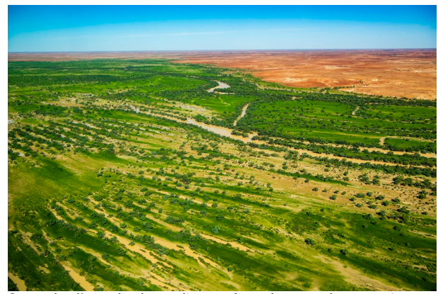
Queensland's wetlands are diverse, from the coastal wet tropics to the semi-arid channel country.

The QWP will work together with its regional network partners to identify opportunities for collecting photographs and other material. Nobody knows a wetland better than the people who live and work around it.