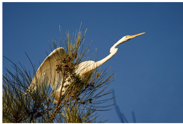
Currawinya Lakes host over 200 bird species with counts of over 100.000 individual birds recorded.