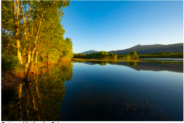
Cattana Wetlands, Cairns.

One of the key outcomes of this project will be to highlight regional wetlands that can be visited by local communities and tourists. An easy-to-use online digital platform and regionally-specific resources will be developed to encourage people to visit these wonderful places.