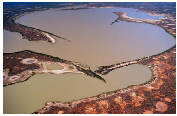
The site contains a rich diversity of inland Queensland wetlands, with a range of freshwater and saline features, such as Lake Numalla.

Although Currawinya's larger lakes, Numalla and Wyara, are within three kilometres of each other, they have separate catchments and different levels of salinity which affects what plants and animals each lake supports.