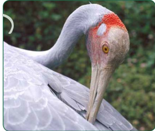
A large population of brolgas can be found in and near the Ramsar site.

them breeding there. Many migratory birds rest and feed here during their annual migration, including large numbers of red-necked stilts. Bowling Green Bay is also an important feeding ground for Brolgas and Magpie Geese, which gather in large numbers and feed on bulkuru sedge at the site and in adjacent areas. More than half the migratory bird species listed in the Japan-Australia Migratory Bird Agreement (JAMBA) and China-Australia Migratory Bird Agreement (CAMBA) visit the wetlands of Bowling Green Bay.