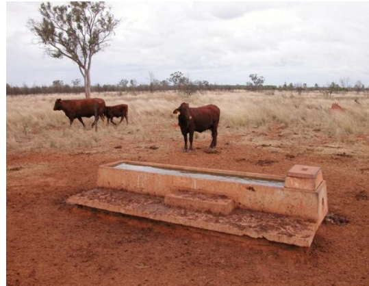
Cattle at a recently installed watering trough that is shared between two new paddocks (from the box-mulga country case study).

The Assessment Toolbox provides users with current wetland assessment methods. Users enter a set of pre-determined criteria into a toolbox function that