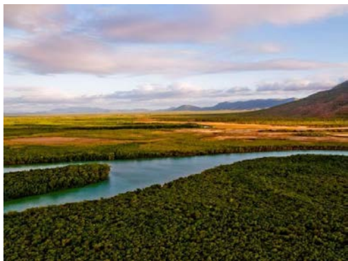
Cape York wetlands.

Wetland mapping and data for wetlands in Queensland enable managers to make confident, effective and accurate decisions about the management and care of wetlands. Anyone can use the maps to find out about wetlands generally or to find out about specific wetlands.