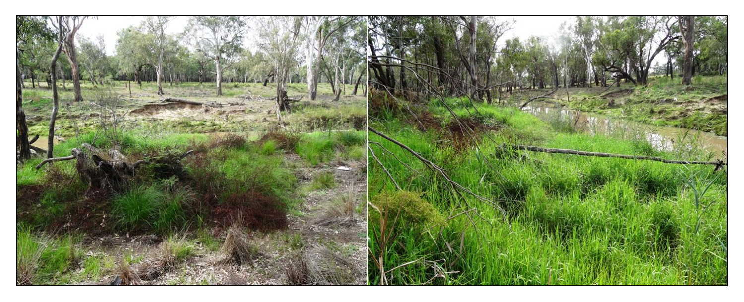
Examples of type 4 spring wetlands (Wambo complex)

Local groundwater flow from surficial aquifers discharges at the wetlands due to the presence of a low-permeability layer underlying the surficial sediments, forcing groundwater to flow to the wetland, and discharges in the banks of the watercourse. The source aquifer for the wetland is recharged seasonally during rainfall events into the sandy surface soils. Therefore, the discharge zone is responsive to short-term rainfall patterns. Three focal zones are described that represent the variability across the wetlands driven by the groundwater and surface water regime.