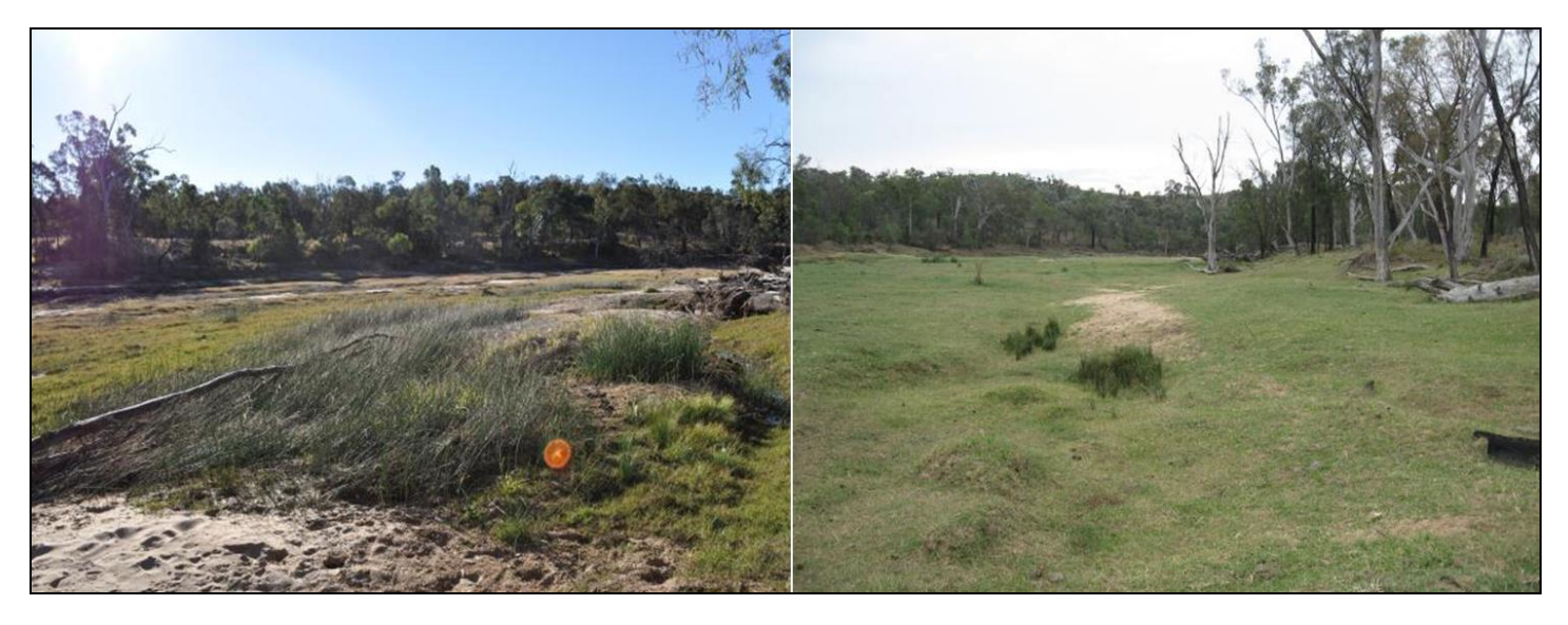
Examples of type 1b spring wetlands (Scott's Creek complex, riverine wetlands)