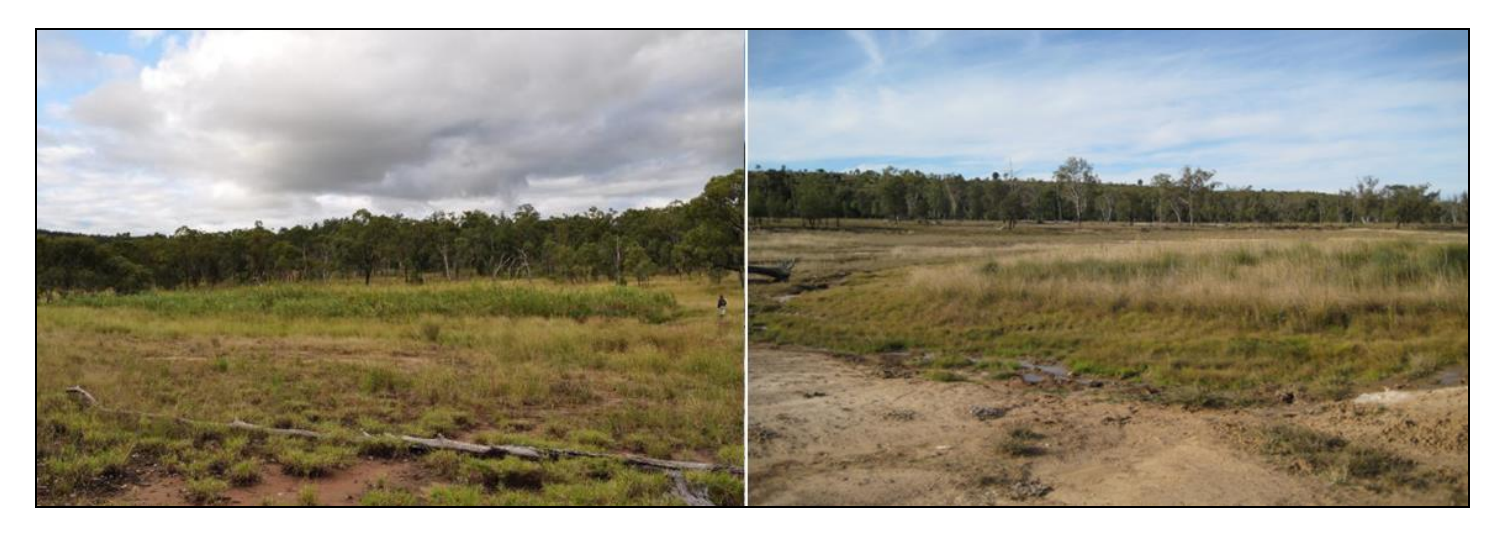
Examples of type 1a spring wetlands (Lucky Last (left) and Scott's Creek (right))

Type 1 wetlands form around a central core of saturated wetland soil. Eight focal zones have been identified primarily on the basis of wetland vegetation. The zones represent the variability across the wet and dry phase of the wetlands, driven by the groundwater regime. These are: